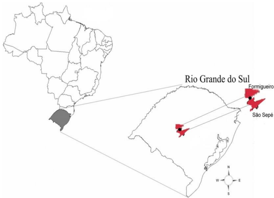
Figura 1: Point location data collection between the currencies of the Municipalities of Sao Sepé and Formigueiro, Central Region, RS.

The study site (Figure 2), is popularly known as Ponta bush retreat and Good, respectively. According to Corrêa et al., (2010), the fragment is considered a riparian forest with about 450 hectares, and its surroundings, affords and are characterized by swamps, where they are used for agriculture (rice and soybean) and livestock (SILVA, et al., 2011).