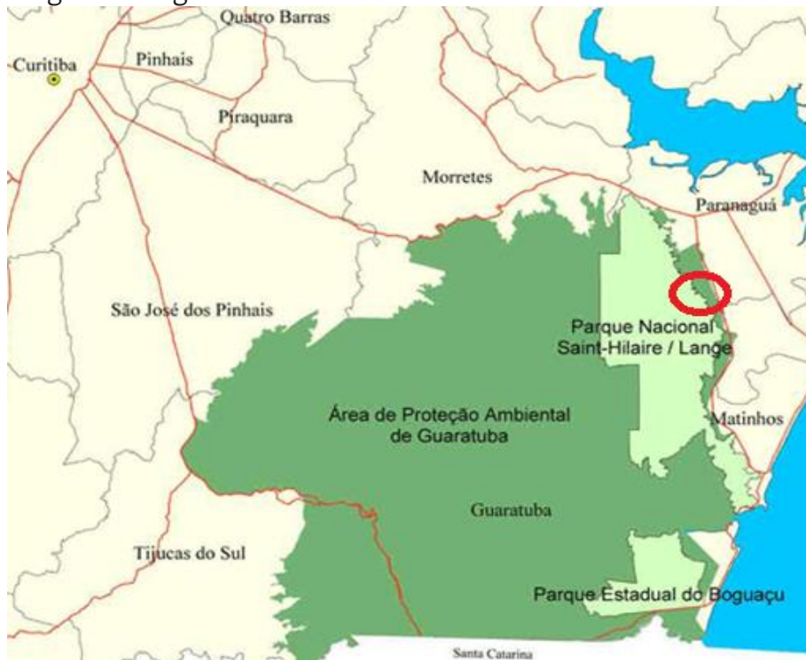
Figure 2 - Region of the Micro Basin of the Pombas River and CU's