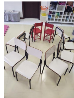
Figure 2: Dance of the Chairs

Situations like this, which are an obvious expression of uncritical hearing-ization, demonstrate that participation and interaction are not enough, and that you have to be a play agent with autonomy. Caring and educating require constant reflection on what learning means for everyone. It is necessary to rethink what proposals will be offered to the children, taking into account their differences as well. This game could easily be modified to include a visual cue. When the music stops, the light could flash or go out. It would be possible to remove the music and just realise the commands with the light flashing or being off. This way, all the children would be playing on equal terms, and Rosa would be fully included without prejudice to hearing children.