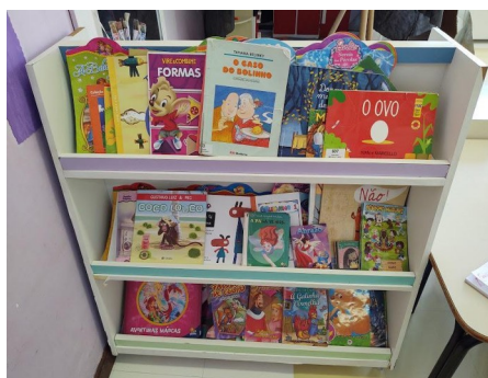
Figure 3: The reading corner bookcase

and was only able to grasp the meaning when adults and children explained it. Examples of some of the onomatopoeia identified in the books were: "Catapum" (sounds of elements falling), "Brrm! Brrm! Brrm!" (sound of a car engine), "Nhac!Nhac!Nhac!" (chewing), "Rinch! Rinch! Rinch!" (horse sounds), "Coach!" (frog croaks) and "Smack, Smack!" (kisses).